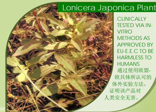
Lonicera Japonica Plant

最小抑菌浓度和筛查试验在低用量0.125%下进行, 认定“无防腐剂”或“不含防腐剂”。